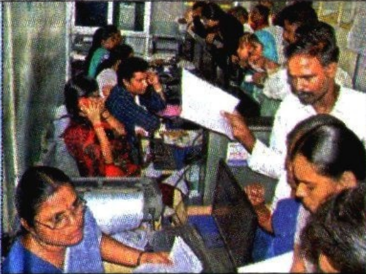
LPG Customers submit forms at a gas agency in Chennai on Monday

IVRS/SMS Visit http://petroleum.nic.in/dbt/sms.html for getting number to call/SMS